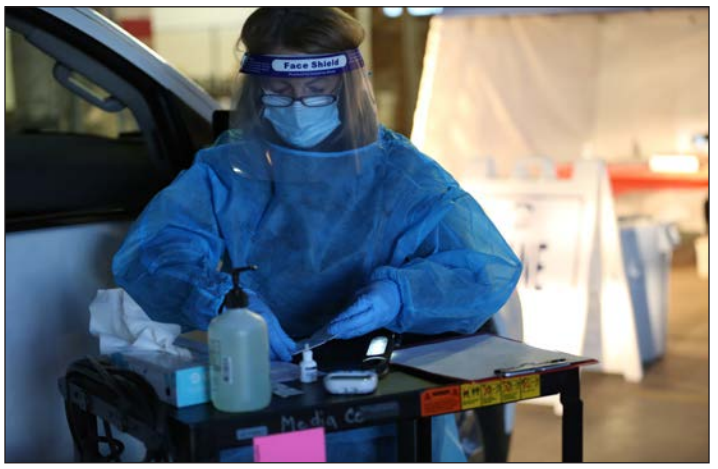
A rapid test is prepared for a student being tested at the district's site.

"This benefits our families and our students," Assistant