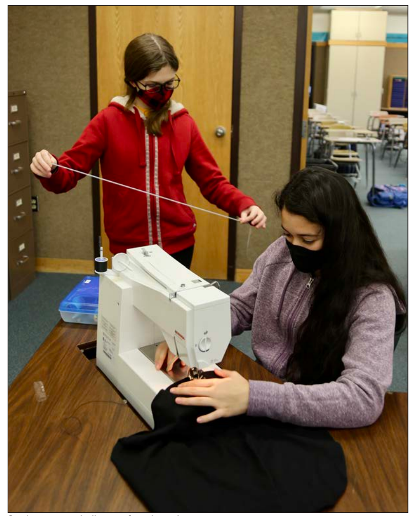
Students sew a bell cover for a large instrument.

"We're living through a time where there isn't much person-to-person interaction encouraged in our lives. So, for the students to be doing a project for someone other than themselves has been really fulfilling for them."