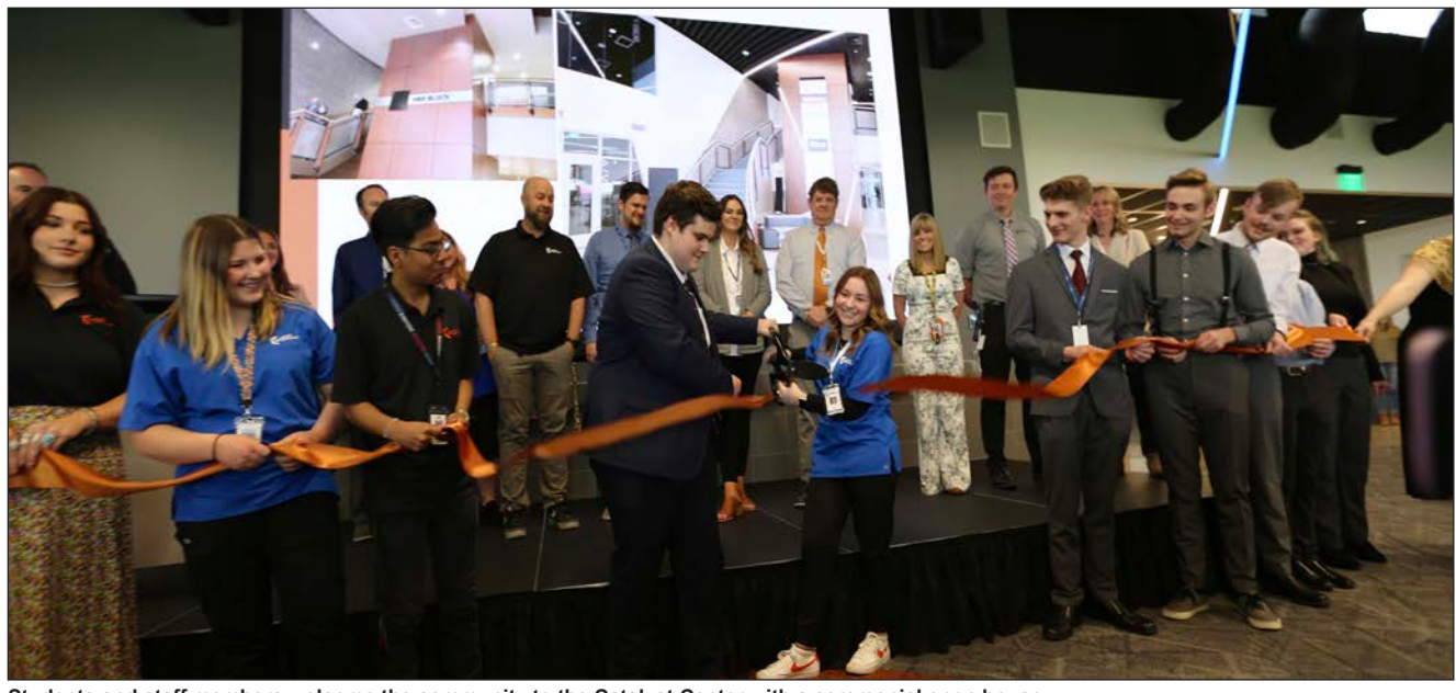
Students and staff members welcome the community to the Catalyst Center with a ceremonial open house.