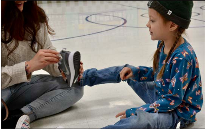
A Fremont Elementary student gets help with her new shoes.