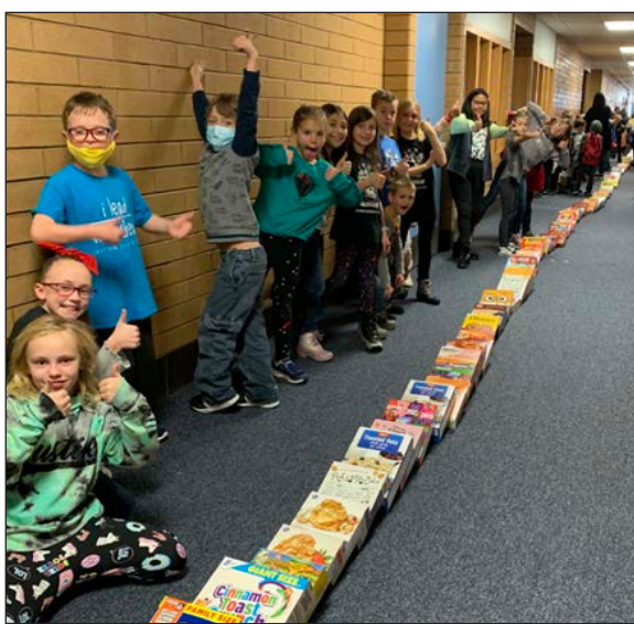
Layton Elementary students celebrate the collection of 900 boxes of cereal.

South Weber Elementary collected food for the Tri City Exchange that