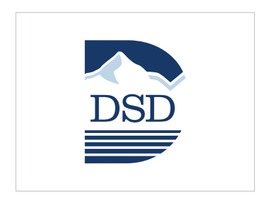
.JPEG (Joint Photographic Experts Group) for use on white backgrounds

Electronic files of all logos in the following formats are available on the district's website under the community relations department, and by request.