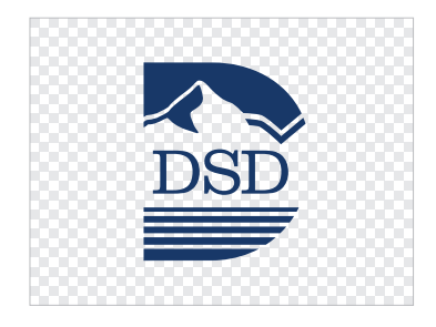
.PNG (Portable Network Graphics) full-color lower resolution compressed file for use on colored backgrounds; not suitable for print