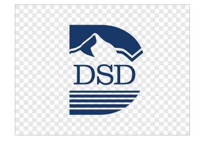
.EPS (Encapsulated Post Script) vector format with high resolution graphics - suitable for print, embroidery, screenprinting, etc.