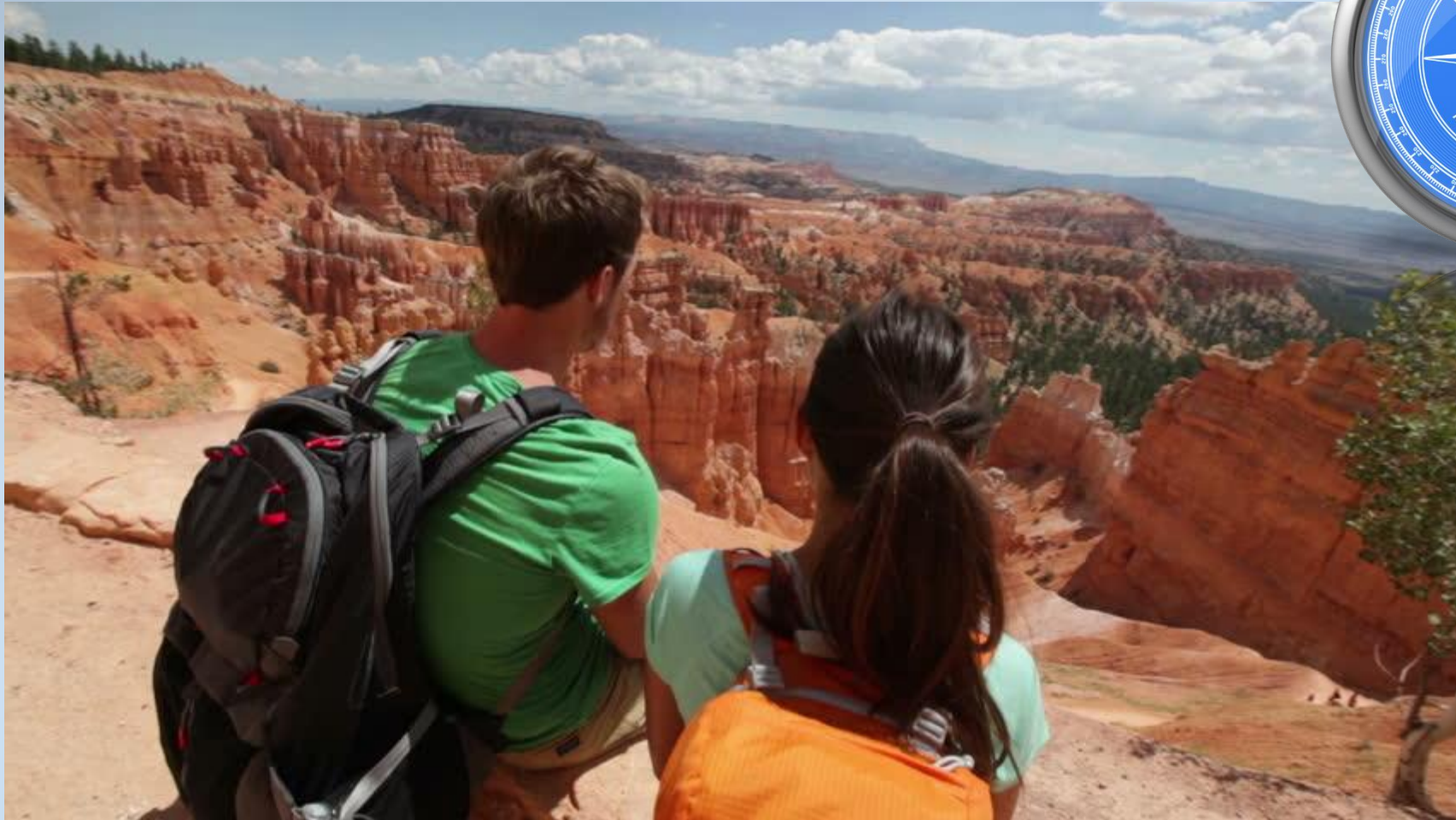
Chart your course now for a secure financial future...